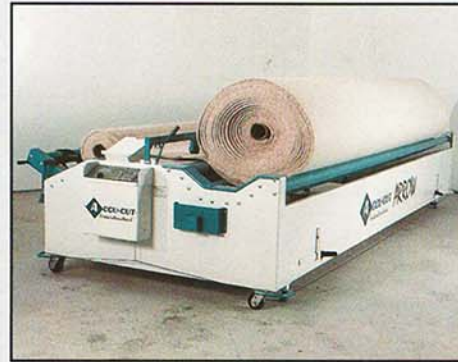
AUTOMATIC VARIABLE SPEED

The variable frequency drives adjust to the proper speed automatically.