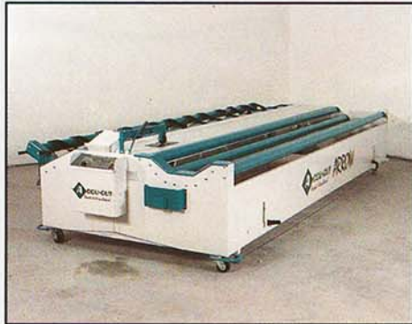
BELTLESS LOAD CRADLE

This ensures the material rolls up straight and tight every time!